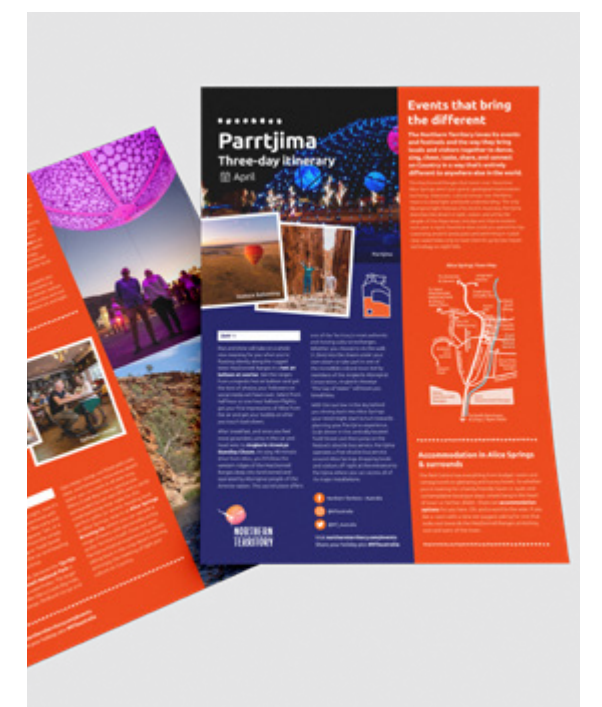
Parrtjima event itinerary

The Seek Different campaign is also significantly supported via strategic public relations activity, organic social media engagement and influencer marketing activity to generate further preference to travel to the Northern Territory.