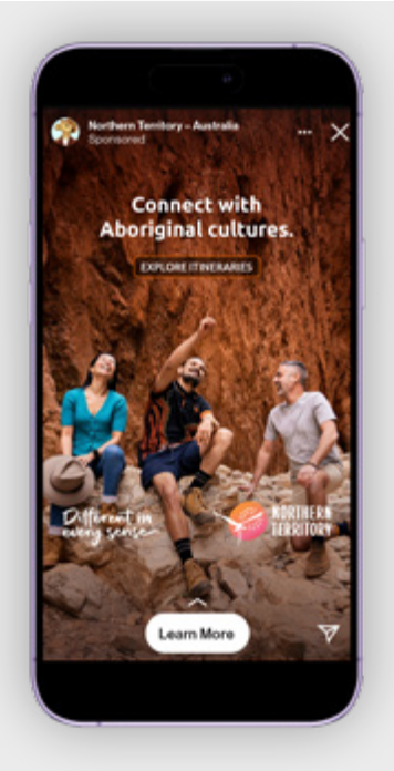
Brand preference Meta advertising