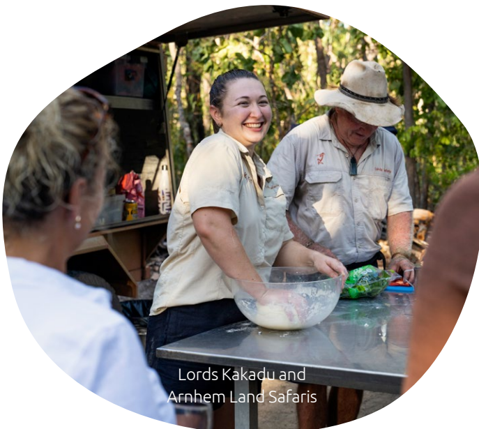
Lords Kakadu and Arnhem Land Safaris