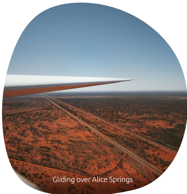
Gliding over Alice Springs