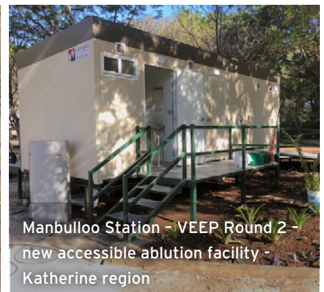
Manbulloo Station - VEEP Round 2 - new accessible ablution facility - Katherine region