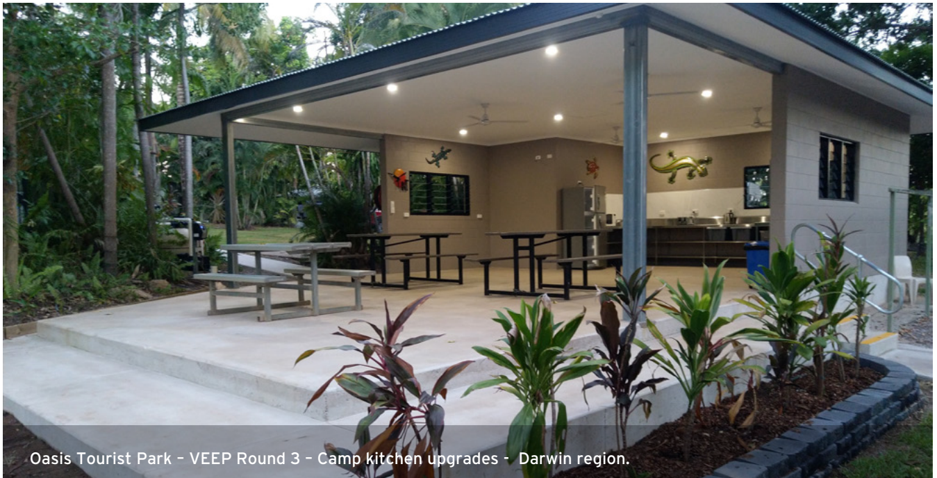
Oasis Tourist Park - VEEP Round 3 - Camp kitchen upgrades - Darwin region.