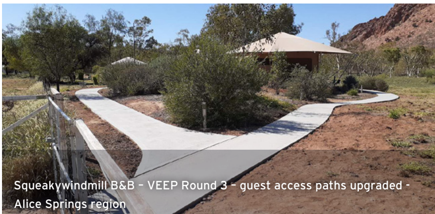
Squeakywindmill B&B - VEEP Round 3 - guest access paths upgraded - Alice Springs region