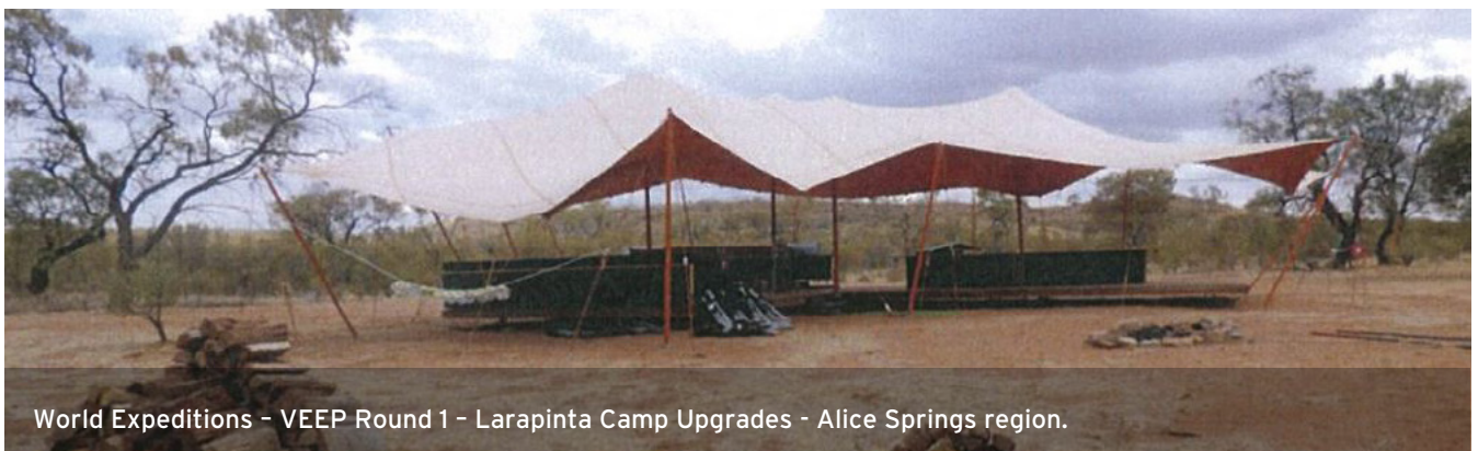
World Expeditions - VEEP Round 1 - Larapinta Camp Upgrades - Alice Springs region.