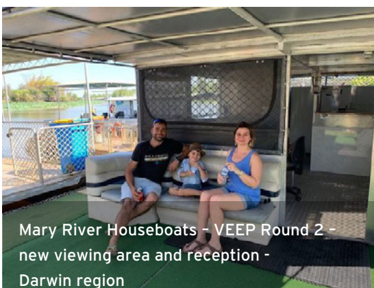
Mary River Houseboats - VEEP Round 2 - new viewing area and reception - Darwin region