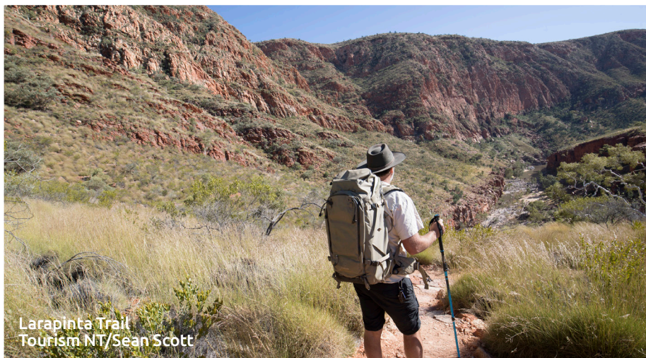
Larapinta Trail