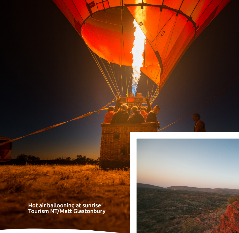
Hot air ballooning at sunrise