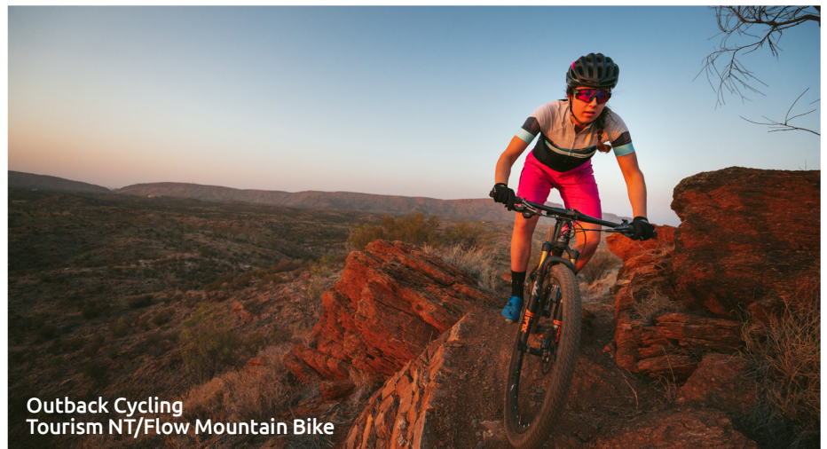
Outback Cycling Tourism NT/Flow Mountain Bike