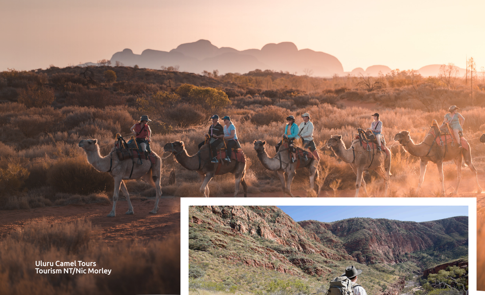
Uluru Camel Tours