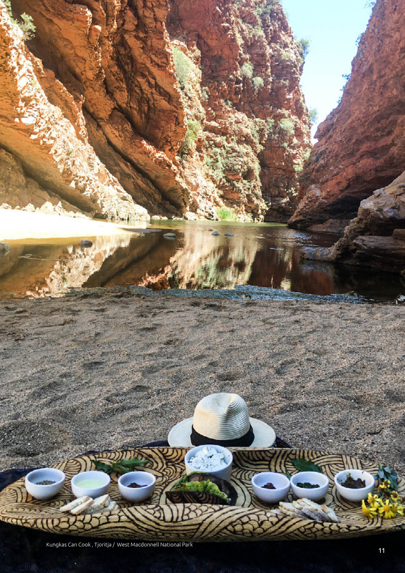
Kungkas Can Cook , Tjoritja / West Macdonnell National Park