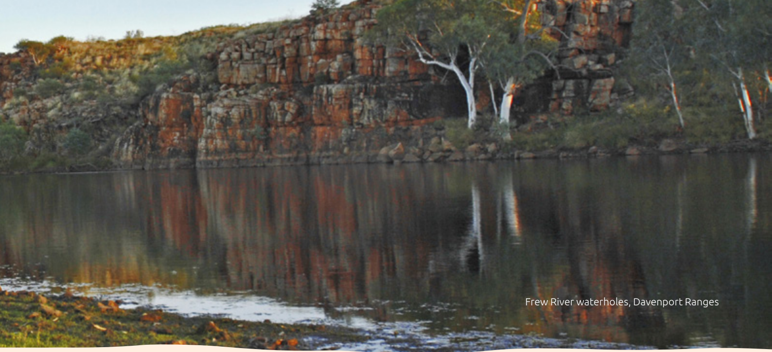
Frew River waterholes, Davenport Ranges