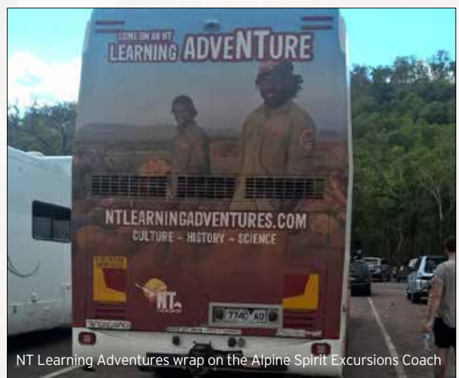
NT Learning Adventures wrap on the Alpine Spirit Excursions Coach