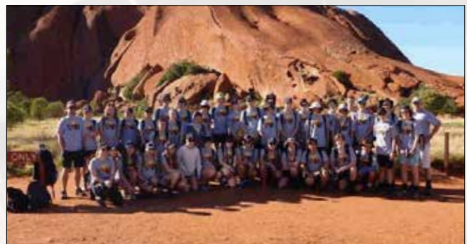
2016 Uluru visit by students from Salesian College, Sunbury, Victoria.