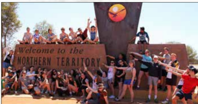
Students point towards another Educational adventure in the NT.

COLLABORATION - Foster productive collaboration across stakeholder groups to drive continuous improvement in addressing the needs of the education tourism sector.