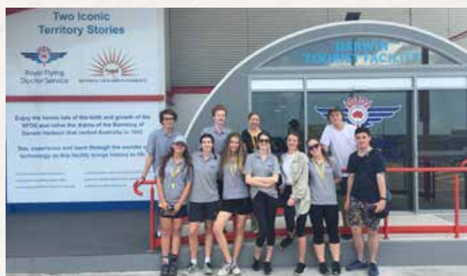
2016 visit by John XXIII College Perth, Western Australia.

Tourism NT will report yearly on these KPIs and provide updated targets based on results.