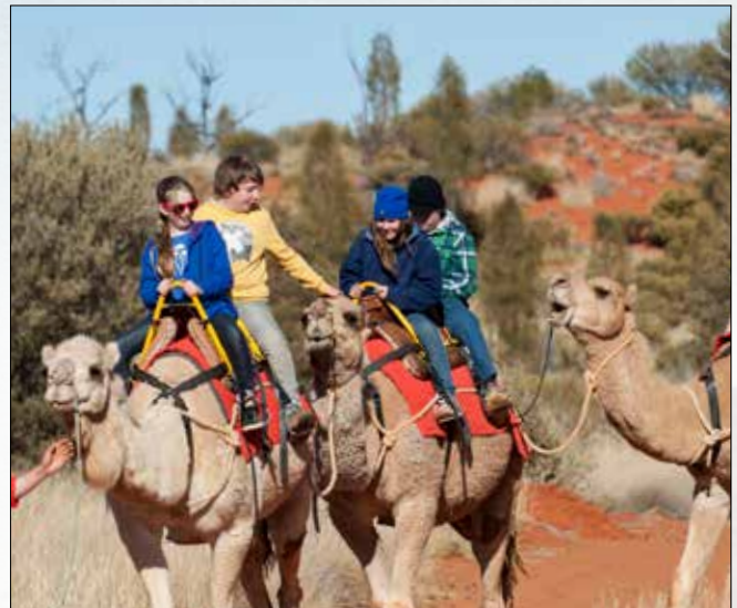
Students enjoy a camel trek with Uluru Camel Tours.